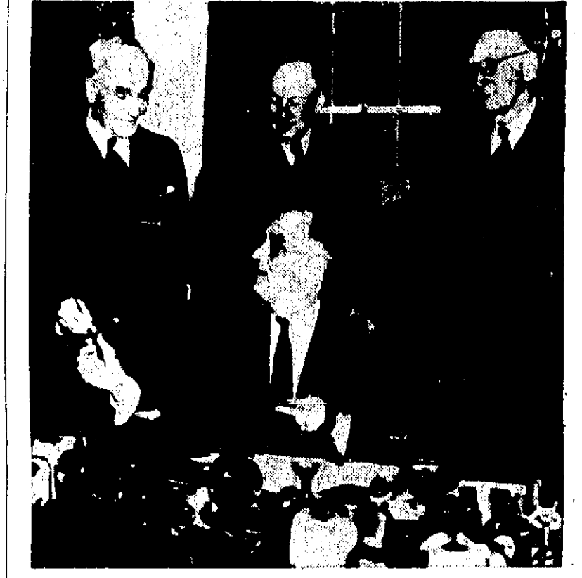
As souvenirs of the occasion, President Roosevelt presented the pens he used in signing the reciprocal trade extension act to those who participated in the ceremony at the White House. Shown (left to right) are Secretary of State Cordell Hull, Sen. Pat Harrison (D-Miss.), and Rep. Robert L. Doughton (D-N.C.) and the President (seated).