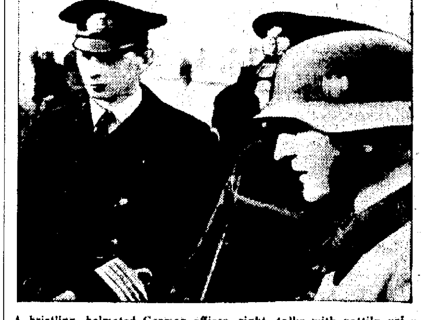
A briefing, helmeted German officer, right, talks with nattily uniformed Danish officers in Copenhagen after the occupation of that city by Nazi troops.