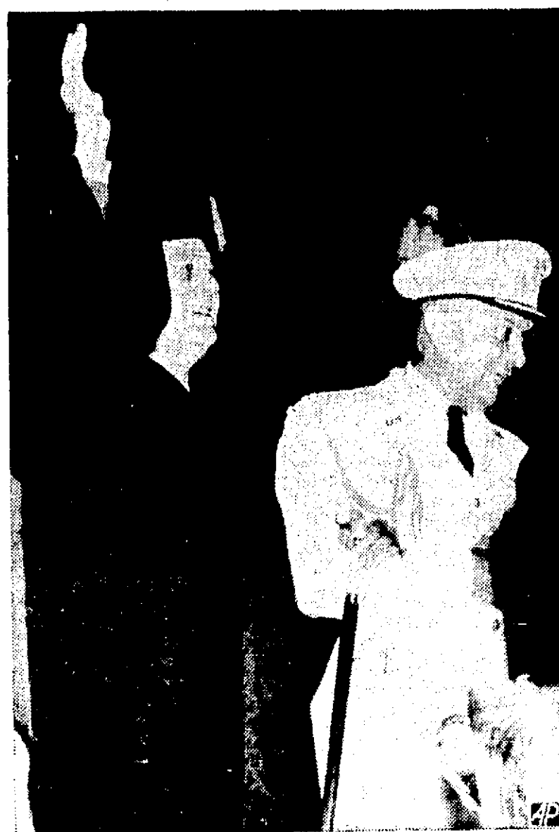
Attired in cap and gown, President Roosevelt sternly rebuked Italy for plunging into war during a commencement address at the University of Virginia, Charlottesville. The President is shown with his secretary, Brig. Gen. Edwin M. Watson, as he greeted the class.