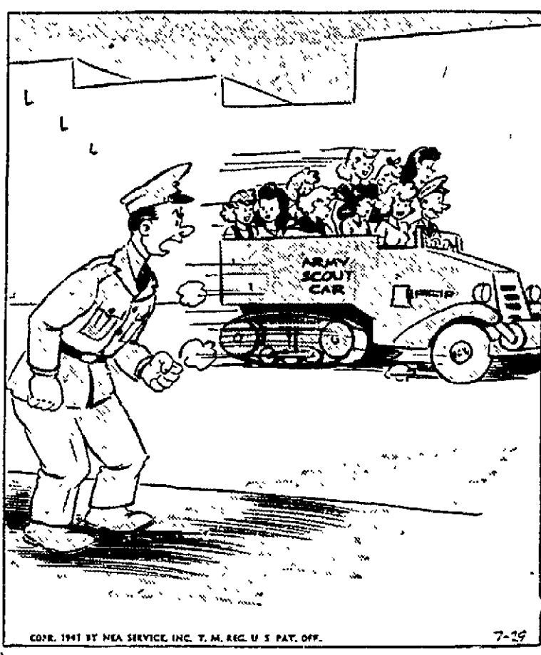
"And me in the parachute division!"