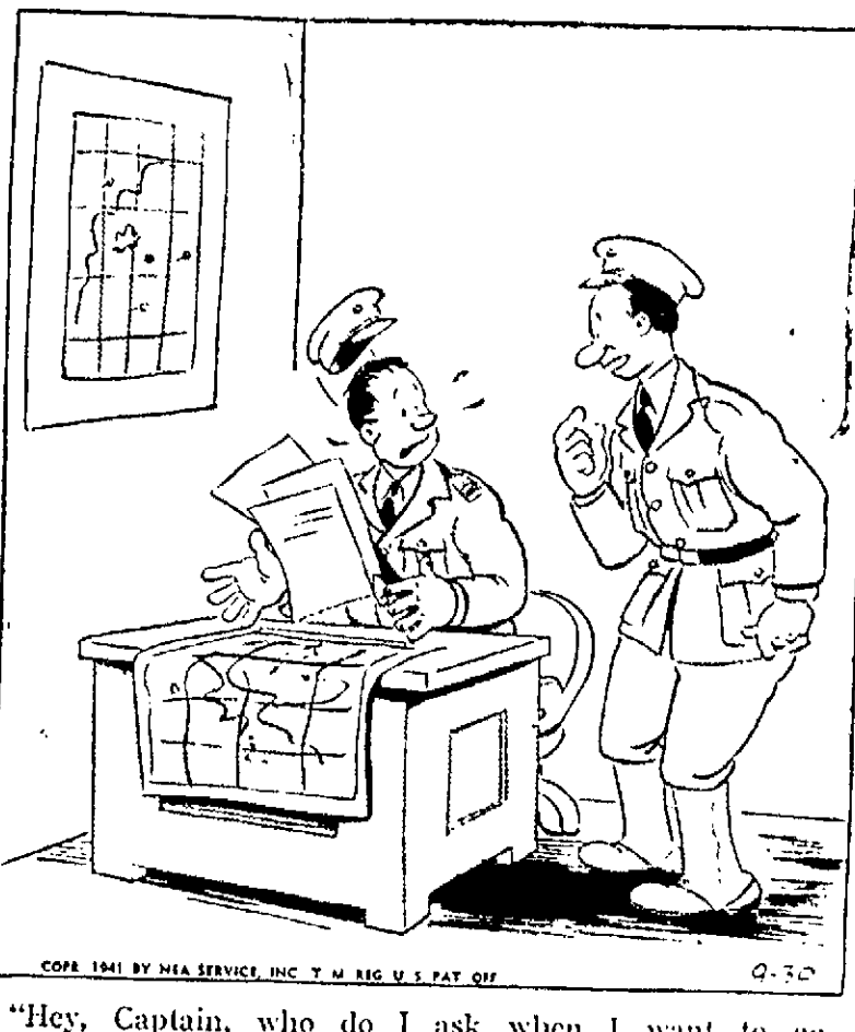
"Hey, Captain, who do I ask when I want to go A. W. O. L.?"