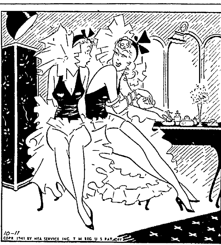
10-11 T. M. REG. U. S. PAT. OFF.