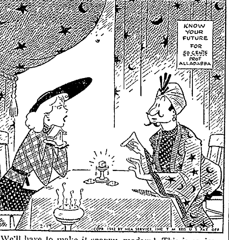
"We'll have to make it snappy, madam! This is an ice cube—I lost my crystal ball!"