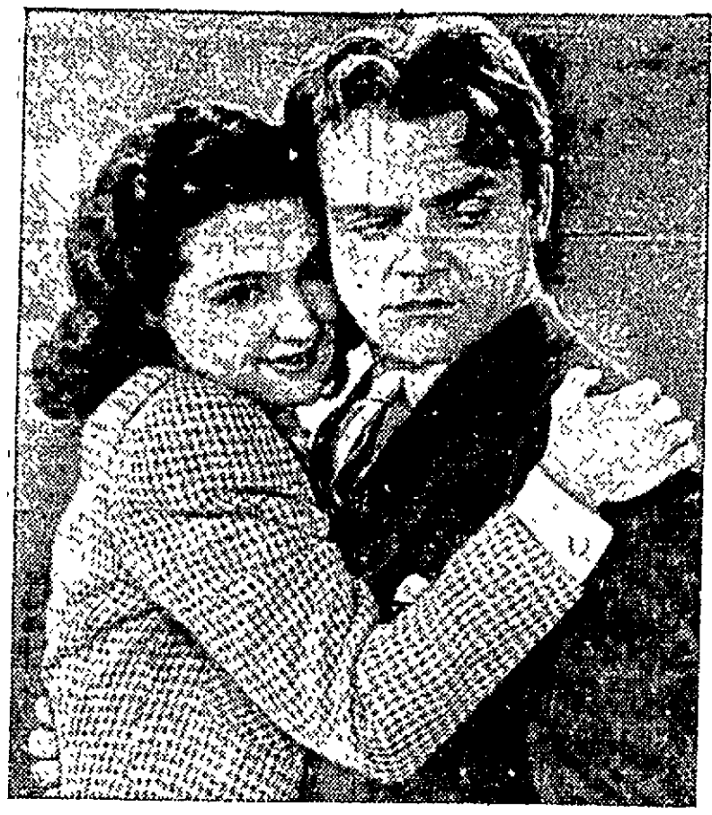
James Cagney and Brenda Marshall are teamed in the new technical hit, "Captain of the Clouds," which starts Saturday at the Ohio.