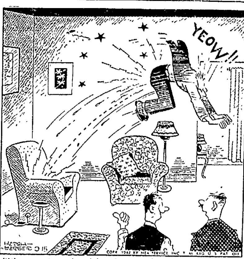
"It's an automatic wiring for armchair generals—every time they start telling how they'd win the war it gives 'em a hot seat!"