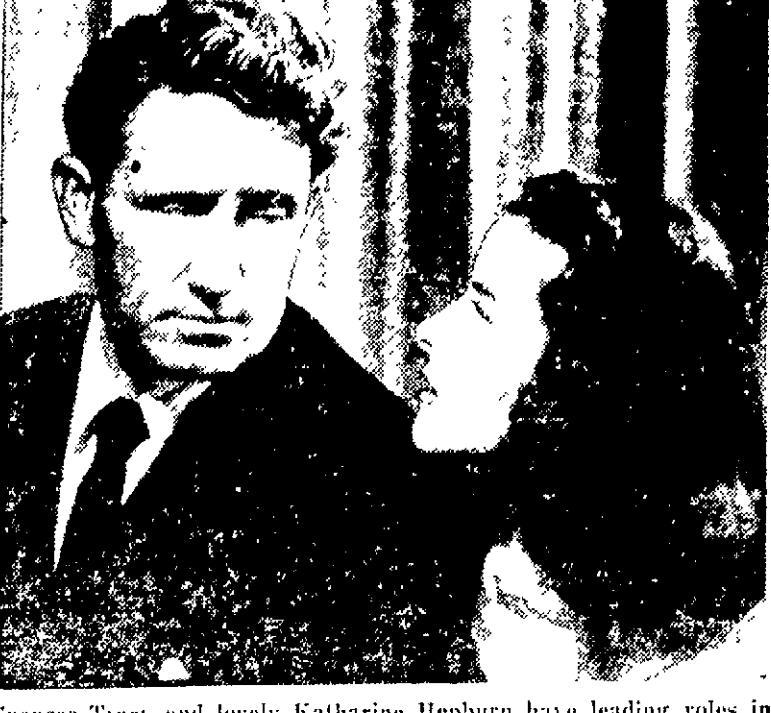
Spencer Tracy and lovely Katharine Hepburn have leading roles in "Keeper Of The Flame," a story of mystery and intrigue, coming to the Ohio on Friday.