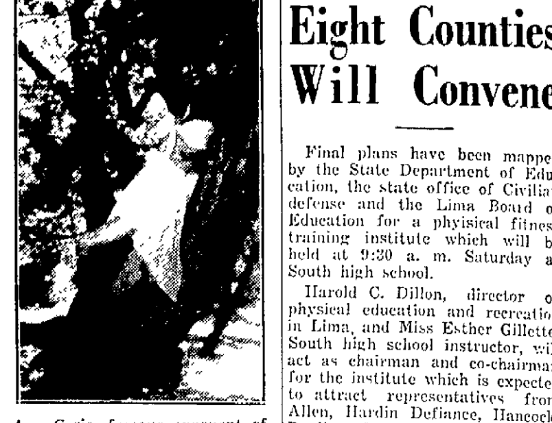
Ann Corio, famous exponent of strip-tease artistry, comes to the Lyric Friday in "Jungle Siren."

The natives to revolt. The plot is deflected by Kuhlaya, the jungle girl, played by Miss Corio, who saves the American Captain's life and promptly falls in love with him.