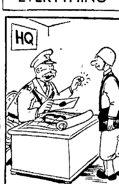
"Guard this message with your life—and on the way back stop and buy me a nickel's worth of jelly beans!"