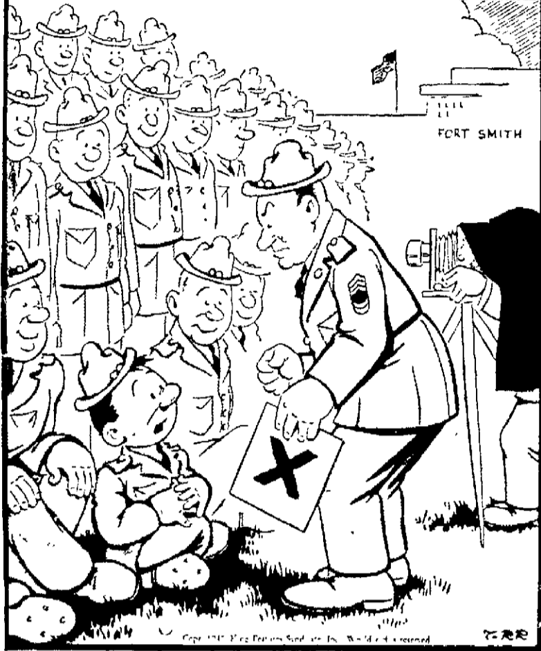
"I just put it in front of me, so Eva wouldn't have to hunt all over the picture to find me!"