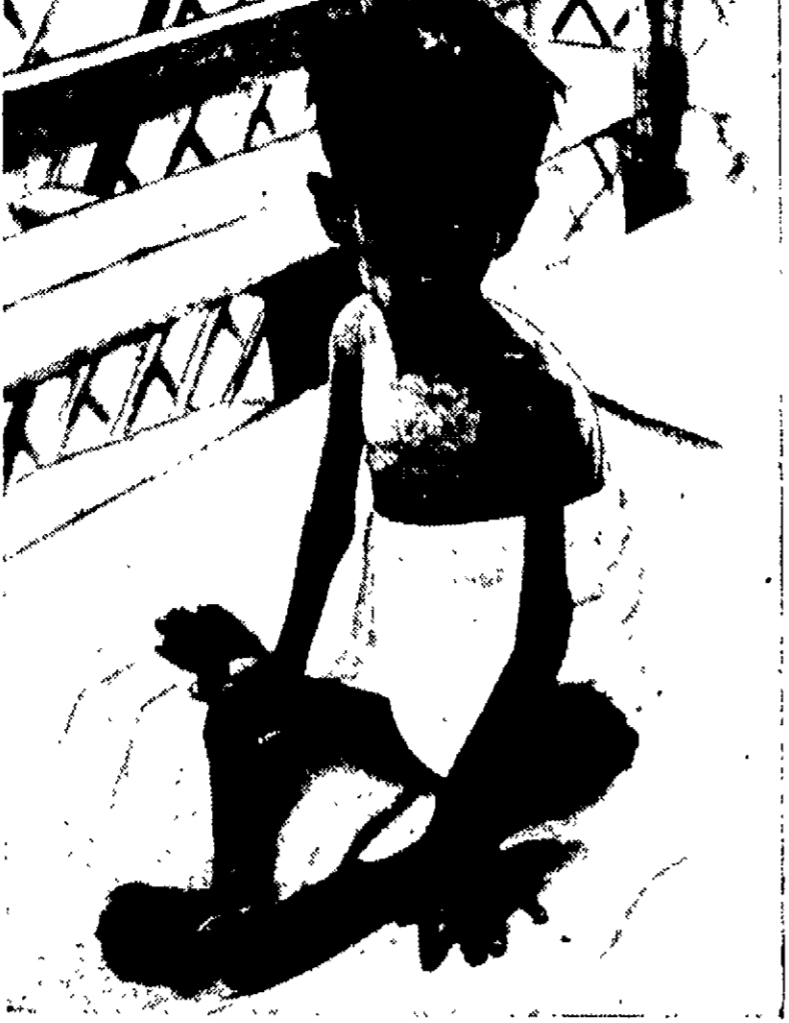
Only the spirit of this Greek child has escaped the invader's cruel hand. The ravages of famine, followed by tuberculosis, typhoid and dysentery are checked by wholesome food and medical supplies from America made possible by Greek War Relief, a member agency of the National War Fund.