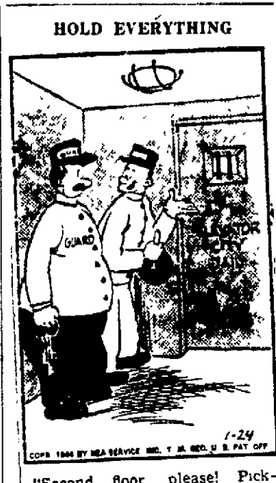
"Second floor, please! Pickpockets, drunks and swindlers!"