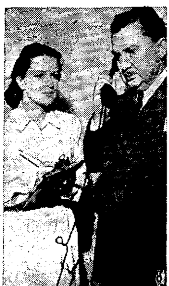
ROSEMARY DE CAMP JEAN HERSHOLT WBBM at 7:30

Drama 7 p. m.—Mr. and Mrs. North (WIBA): "Pam Keeps Out of Trouble." 7:30 p. m.—Dr. Christian (WBBM): Jean Hersholt as Dr. Christian, solves a 20-year-old hatchet murder mystery in dramatization of "The Old Ridgeley Farm."