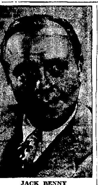
JACK BENNY WIBA at 5 p. m.

MARKETS MONDAY A. M. 5:00 WLS 12:10 WIBU 5:00 WLS 12:15 WIBA 11:00 WLS 12:30 WIBU 11:30 WGN 12:45 WIBA 12:00 WIBU