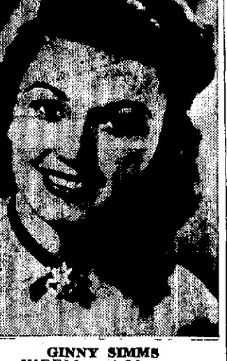
GINNY SIMMS WBBM at 4:30 p. m.