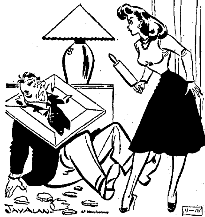
"Okay, chum, you've been framed!"