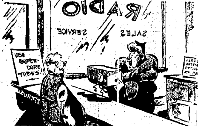
"Fix it, please! I'm told it has been insulting my intelligence!"

Q. Is there a simple way to remove scratches from the windshield of a car? J. L. A. Fine emery and water followed by optician's rouge applied with a soft cloth may be used. This treatment is employed to polish lenses.