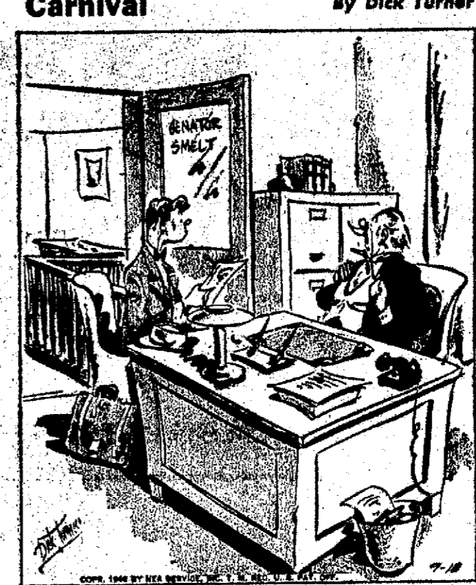
"I'm not interested in buying a policy, young man, but would you mind repeating those wonderful promises? I can use them in my campaign!"