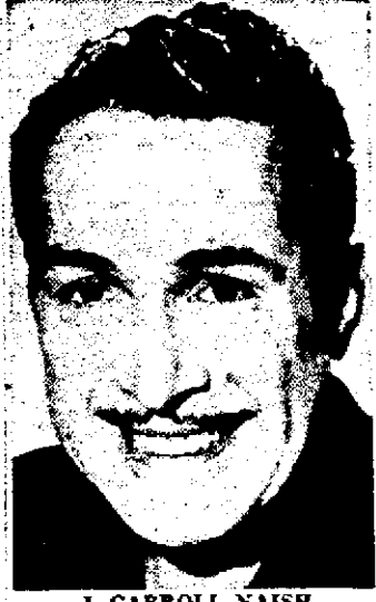
J. CARROLL NAISH

9:15 a. m.—Nursery School (WHA): "Rumpelstiltskin." 9:30 a. m.—Exploring Science