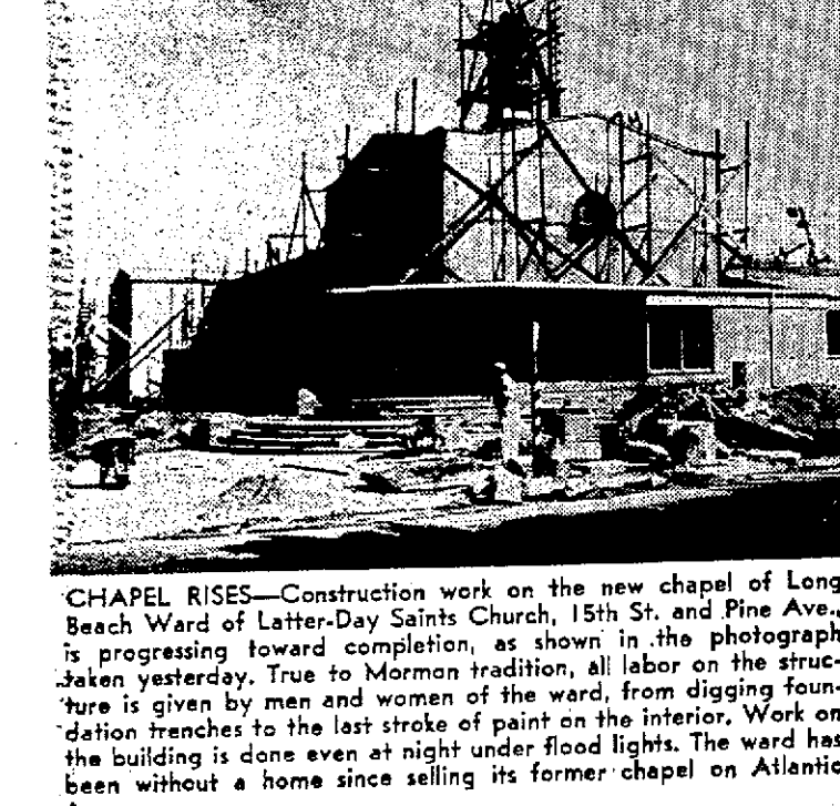
CHAPEL RISES—Construction work on the new chapel of Long Beach Ward of Latter-Day Saints Church, 15th St. and Pine Ave., is progressing toward completion, as shown in the photograph taken yesterday. True to Mormon tradition, all labor on the structure is given by men and women of the ward, from digging foundation trenches to the last stroke of paint on the interior. Work on the building is done even at night under flood lights. The ward has been without a home since selling its former chapel on Atlantic Ave.

PHANTOM FROLIC COLLEGE SPOOKS—Halloween spirits, complete with ghosts and hobgoblins, will prevail tonight at the Phantom Frolic in the Student Union on campus at City College.