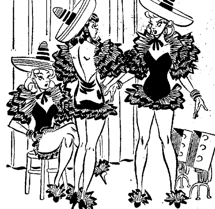
"Okay, so what if the show is a turkey? It's only a few days until Thanksgiving, isn't it?"