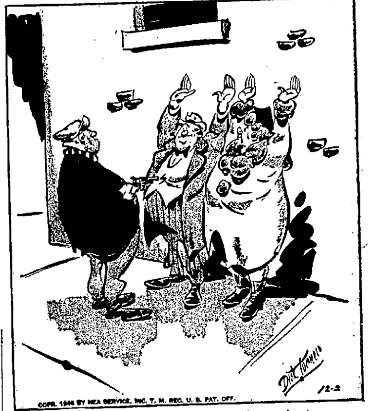
"Why don't you scream at him, Elmo, like you do at me when I ask for money?"