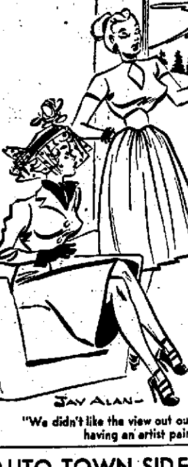
"We didn't like the view out our picture window so we're having an artist paint a new one!"