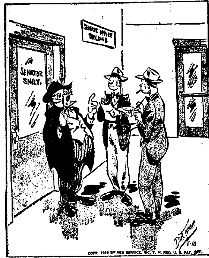
"Tell your papers I believe we owe free medical protection to the people! Haven't we politicians worried the people sick over one thing or another for years?"