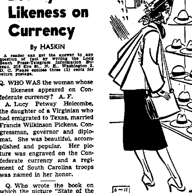
"My goodness, Harry, what do you need another hat for? You don't have two heads, do you?"