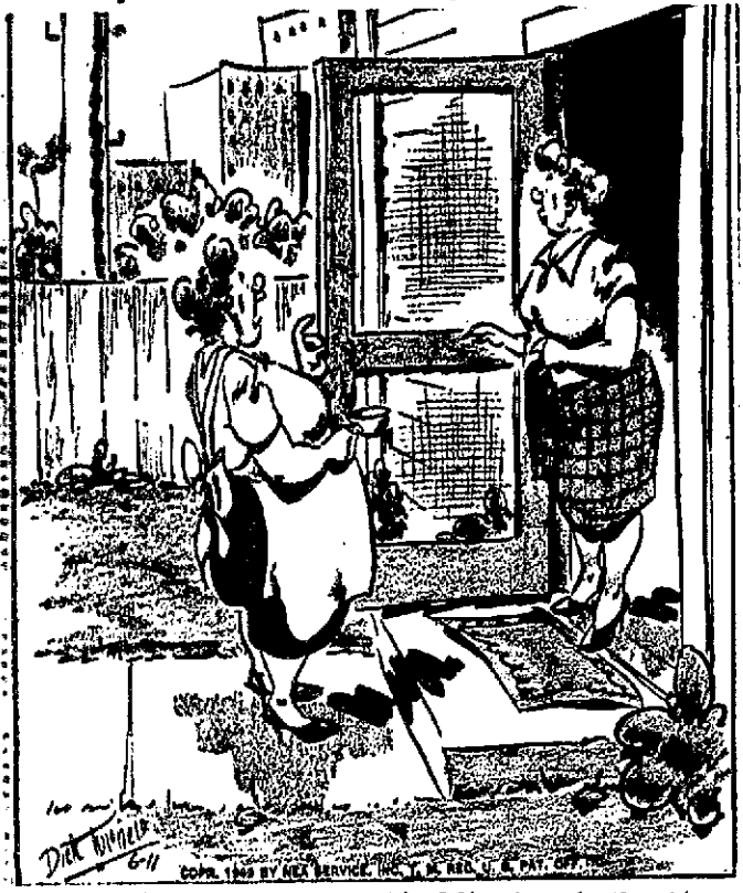
"You haven't got any sugar either? Then I wonder if you'd mind lending me your husband to run to the store?"