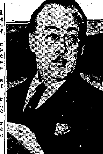
JOHN BARRYMORE (1939 Photo)