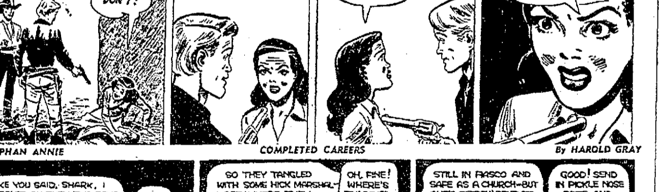
THE GUMPS LIKE YOU SAID, SHARK, I CHECKED ON THEM TWO BOYS YOU SENT TO PIRASCO TO GRAB THE MID. ANNIE-- SO? SO THEY TANGLED WITH SOME NICK MARSHAL. I SEEN WHERE THEY BURIED 'EM-- OH, FINE! WHERE'S THE BART NOW? STILL IN PIRASCO AND SAFE AS A CHURCH--BUT SLEEPS GETTING SENT TO A FANCY GALS' SCHOOL--GORGON BY TRAIN-- GOOD! SEND IN PICKLE NOSE IN PICKLE NOSE JUDGE JOE!