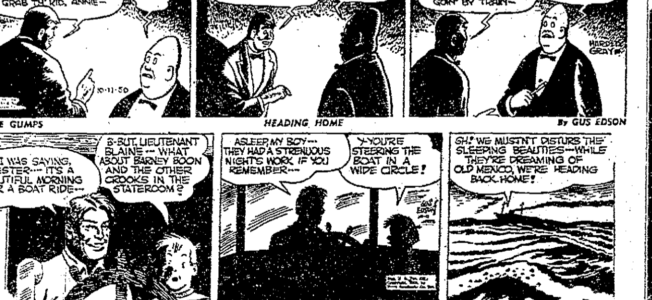
HEADING HOME AS I WAS SAYING, CHESTER-- IT'S A BEAUTIFUL MORNING FOR A BOAT RIDE-- BUT, LIEUTENANT BLAINE-- WHAT ABOUT BARNEY BOON AND THE OTHER CROOKS IN THE STATEROOM? ASLEEPAN BOY-- THEY HAD A STRENUOUS NIGHT'S WORK IF YOU REMEMBER-- SH! WE MUSTN'T DISTURB THE SLEEPING BEAUTIES--WHILE THEY'RE DREAMING OF OLD MEXICO, WE'RE HEADING BACK HOME!