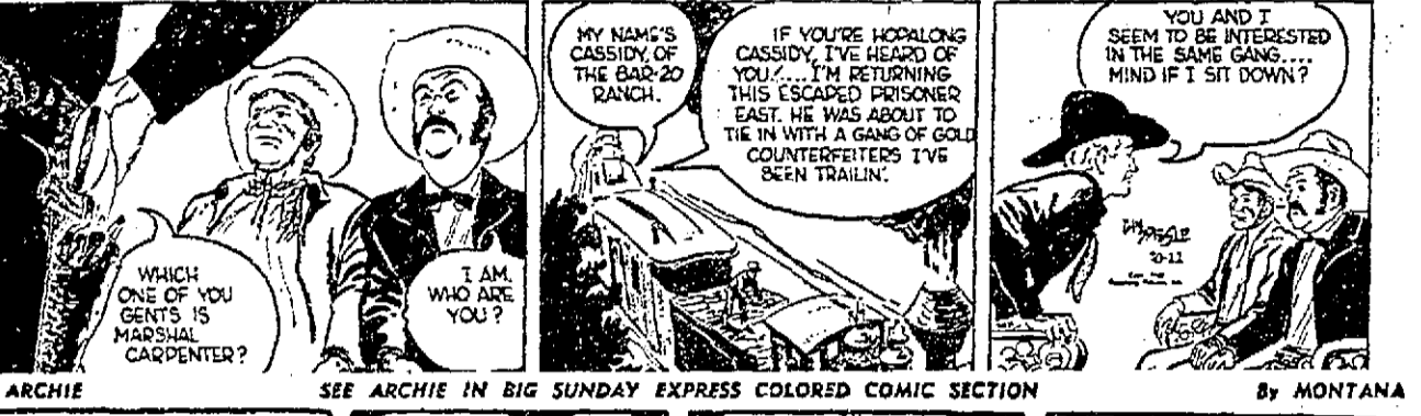
ARCHIE SEE ARCHIE IN BIG SUNDAY EXPRESS COLORED COMIC SECTION By MONTANA